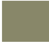
8 oz. — Palomino