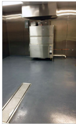
CSI Division 9: Finishes - Flooring