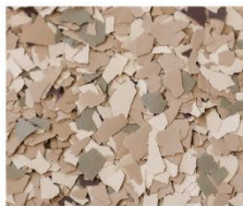
Desert Stone (FB-504)