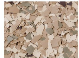
Desert Stone (FB-504)