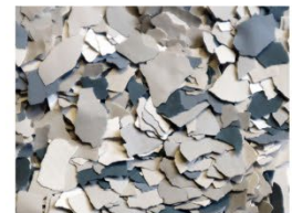
Hazy Blue (FB-807)