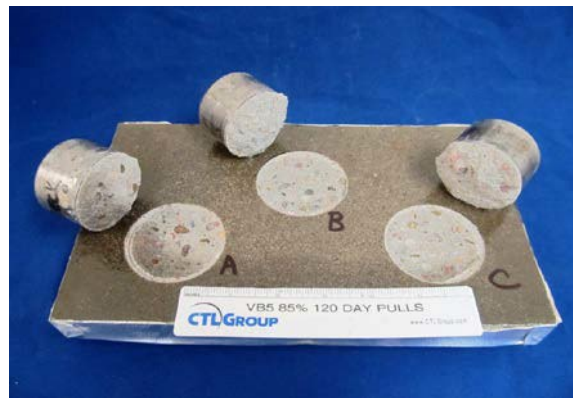
Figure C E100-VB5 over 85% RH