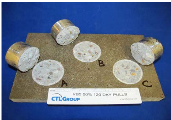
Figure B E100-VB5 over 50% RH