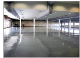
CSI Division 9: Finishes - Flooring