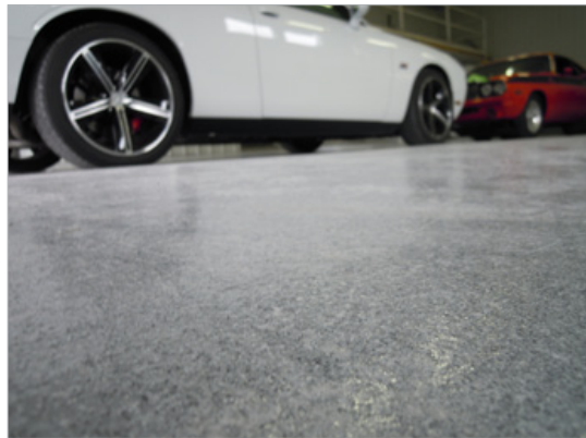
CSI Division 9: Finishes - Flooring