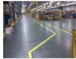
CSI Division 9: Finishes - Flooring