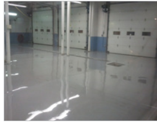
CSI Division 9: Finishes - Flooring