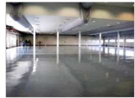
CSI Division 9: Finishes - Flooring