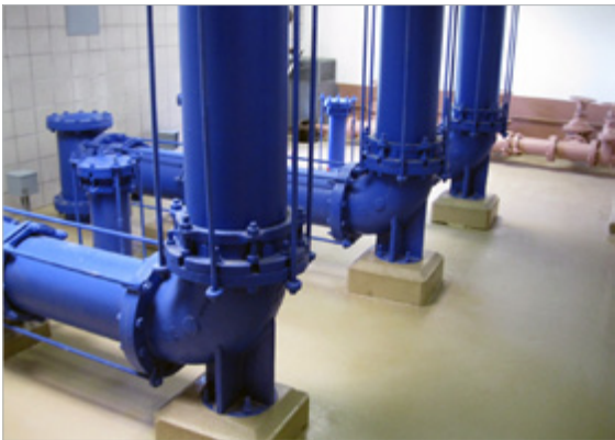
CSI Division 9: Flooring - Fluid Applied