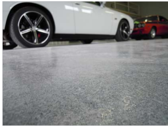
CSI Division 9: Finishes - Flooring